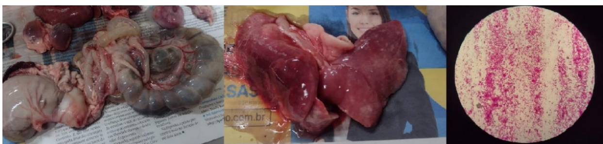
Figure 3. Sequential images from the necrotic study of the rabbit and Gram stain research of the nasal abscess. In the left image, there is a picture of enteritis, with the presence of intestinal gases and poorly digested material. Next, pulmonary abscesses in both lungs are observed. Finally, confirmation of the pathogen in the mucopurulent material removed from the nasal region.

Despite the collection of material for an antibiogram, on June 29, the rabbit passed away, concluding its period of treatment and medical monitoring. Subsequently, a necropsy of the animal was performed, and contents from the abscess in the nasal region were collected for microbiological study, confirming the presence of the Pasteurella spp. pathogen (Figure 3).